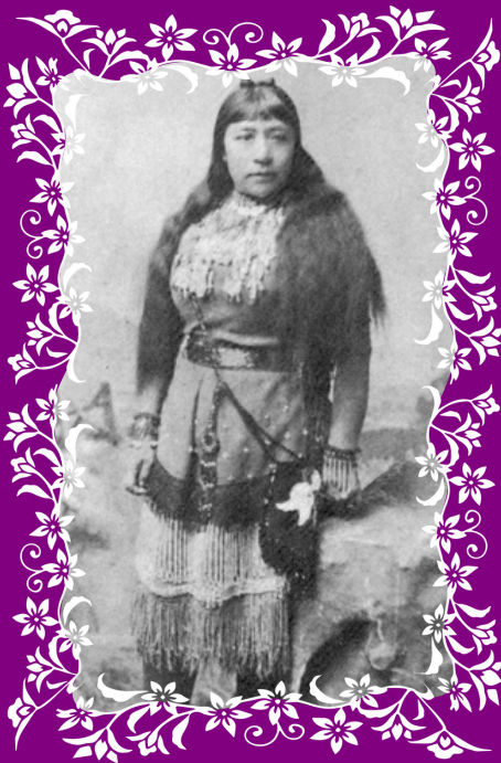
Sarah Winnemucca (1844 - 1891)

This year, the theme is Celebrating Women Who Advocate for Equity, Diversity, and Inclusion , which recognizes women who “understand that, for a positive future, we need to eliminate bias and discrimination entirely from our lives and institutions.”